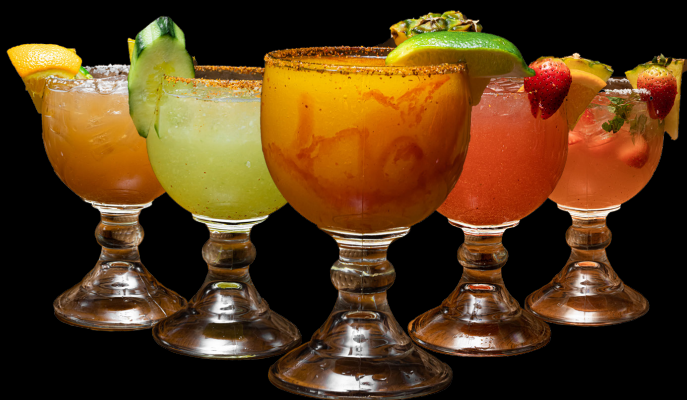
Strawberry Mint Margarita