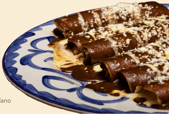
Enchiladas Mole Poblano

Seafood Piña $25.25 Shrimp, scallops, fish fillet, special sauce, topped with Oaxaca cheese, served with rice and avocado salad.