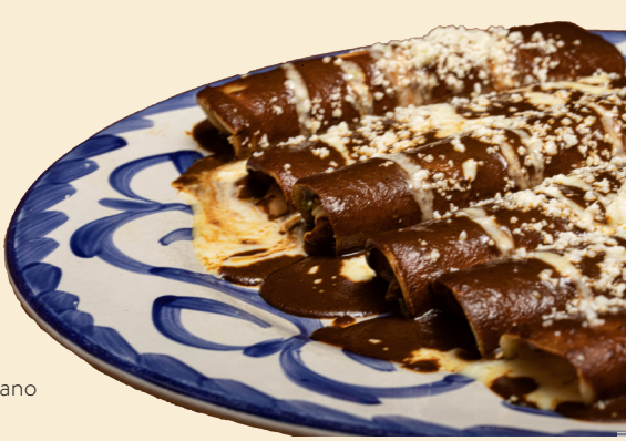
Enchiladas Mole Poblano

Seafood Piña $27.50 Shrimp, scallops, fish fillet, special sauce, topped with Oaxaca cheese, served with rice and avocado salad.